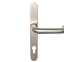
Stainless door handle