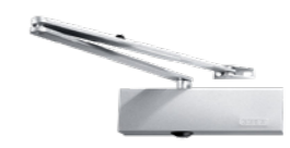
GEZE TS2000 - link arms