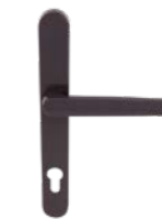
Door handle for roller shutter