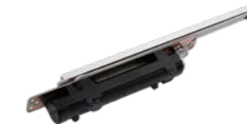
DORMA ITS96 - hidden