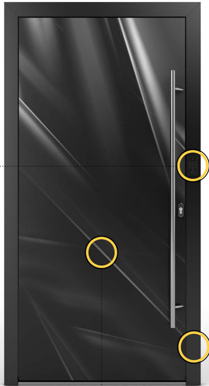
Model 15 | Sample 1