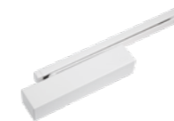
DORMA TS93 BASIC - rail